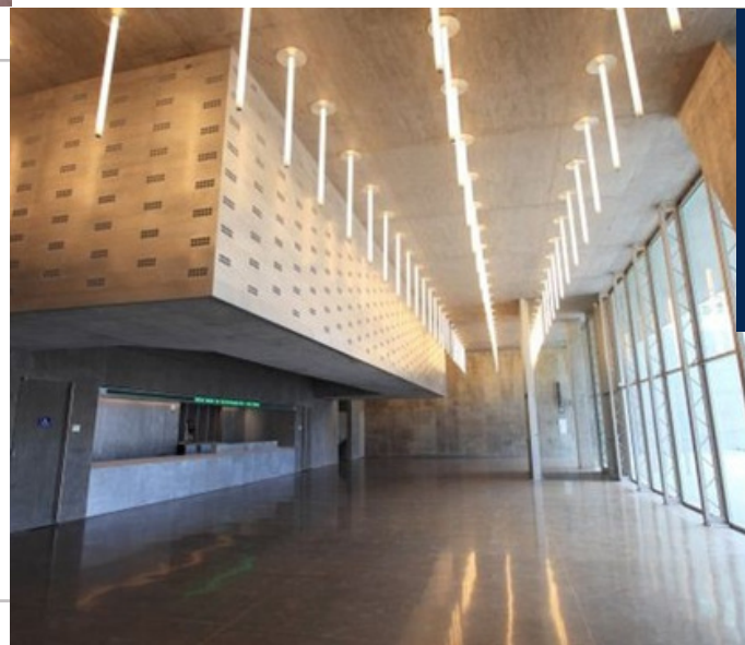
DEE & CHARLES WYLIE THEATER DALLAS TX

Learn to identify and understand the concrete polishing processes and procedures as well as the benefits to utilizing concrete over other flooring/paving options. 1-hour program providing AIA architects with 1 LU HSW toward their annual requirements.