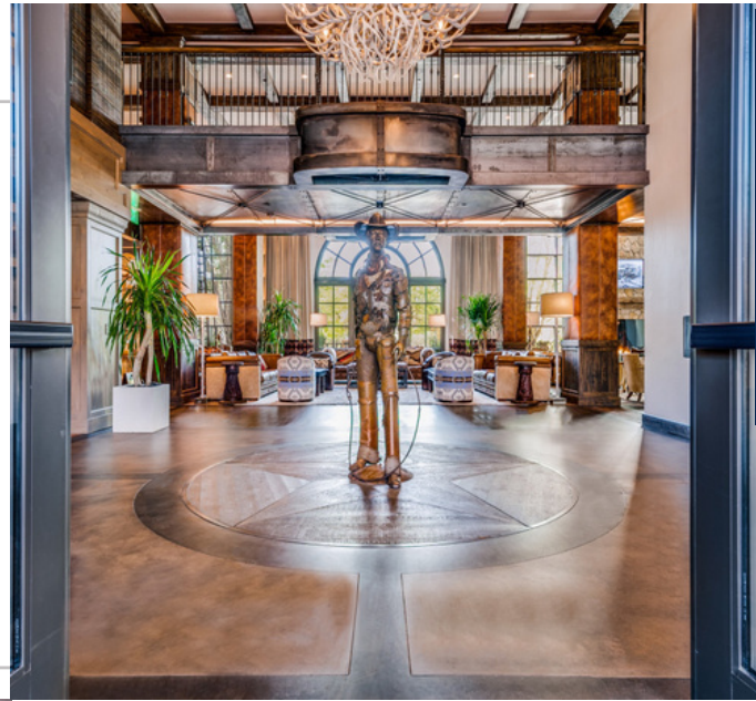
HOTEL DROVER FORT WORTH, TX

This program examines the latest techniques and trends in decorative concrete flooring, including overlays, micro-toppings and textured/imprinted options. 1.5-hour program providing AIA architects with 1.5 LU HSW toward their annual requirements.