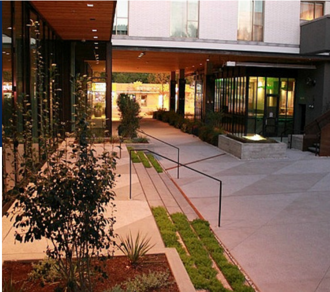
SOCO HOTEL AUSTIN, TX