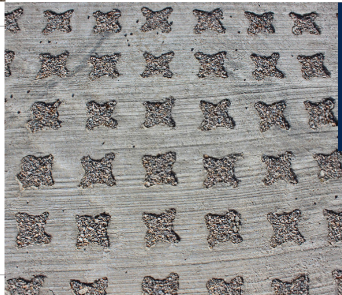
VICTORY PARK DALLAS TX

This program is designed to look at concrete cast with voids or openings as a decorative, structural and environmentally-friendly option to traditional non-pervious concrete or unit-type non-pervious pavements. 1-hour program providing AIA architects with 1 LU HSW toward their annual requirements.