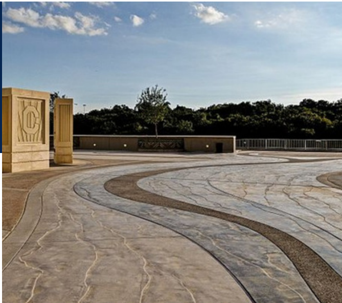
TCU STADIUM FORT WORTH, TX