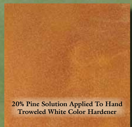
20% Pine Solution Applied To Hand Troweled White Color Hardener