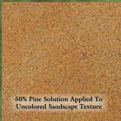
50% Pine Solution Applied To Uncolored Sandstone Texture