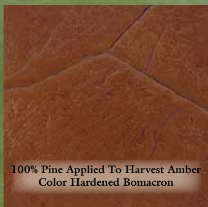
100% Pine Applied To Harvest Amber Color Hardened Bomacron